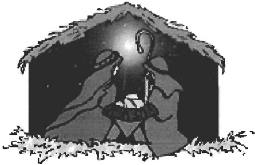
Our Lord and Savior Jesus Christ Was Born